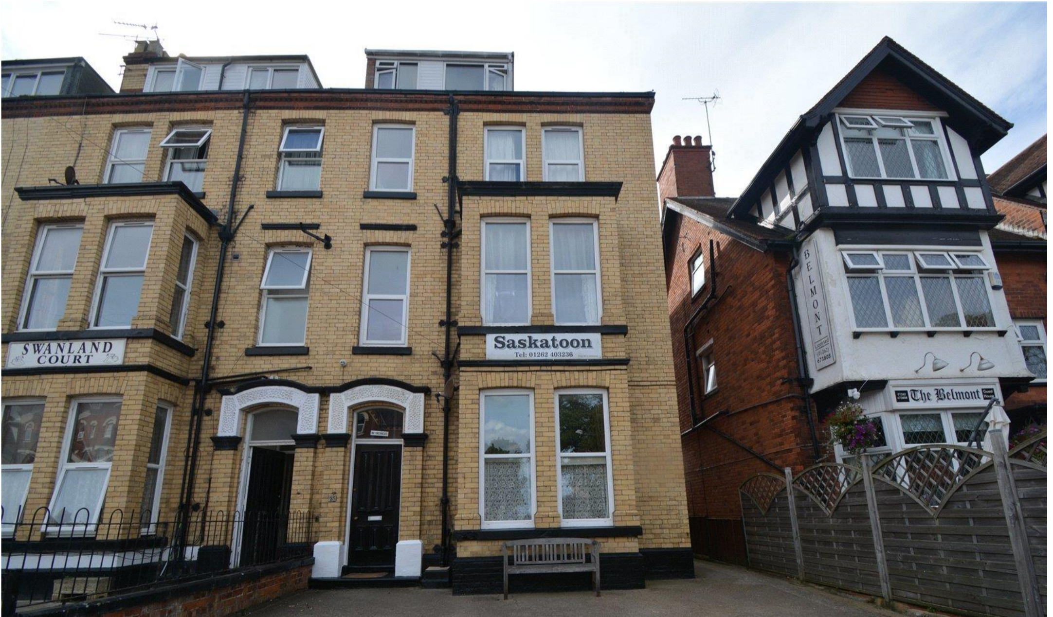
25 Flamborough Road, Bridlington, East Yorkshire, YO15 2HU